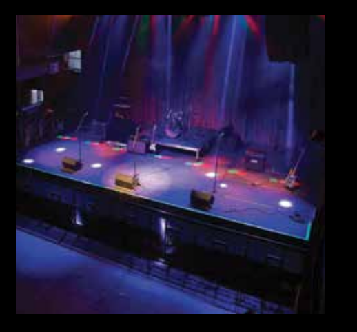
Each staging, riser and platform option is strong, easy to handle and fast to set up. No matter where you perform, you'll have confidence in our support.